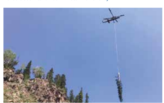
Tree removal by helicopter is the only practical method of vegetation clearing in the high mountain terrain. By law, wherever a helicopter bearing load will cross the highway, the road must be closed.