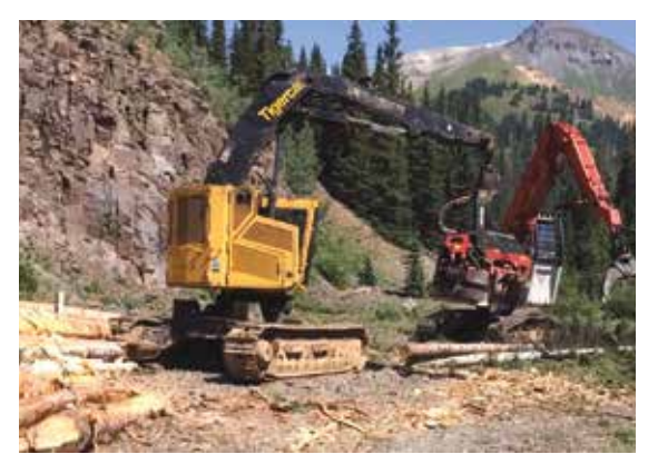
Above Highway 550, a timber loader and a logging processor turn felled trees into lumber.

This experience has caused SMPA to put a hold on the construction phase of the project, which will delay any work on redundant power or broadband expansion. However, the newly cleared right-of-way will improve fire mitigation in the region substantially.